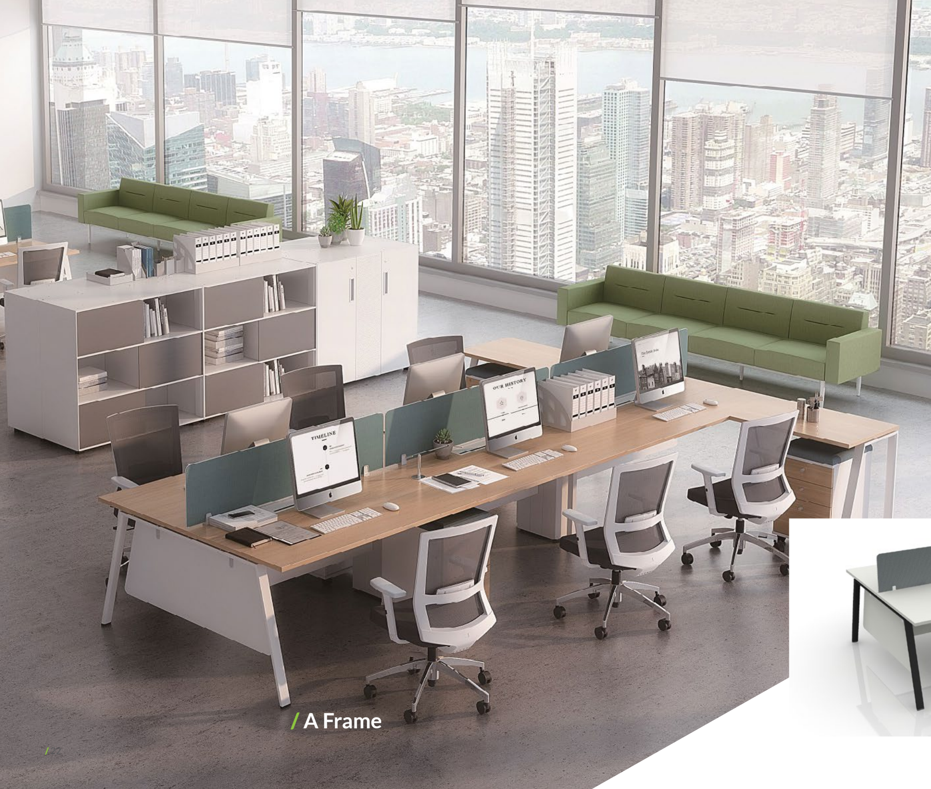
/ A Frame