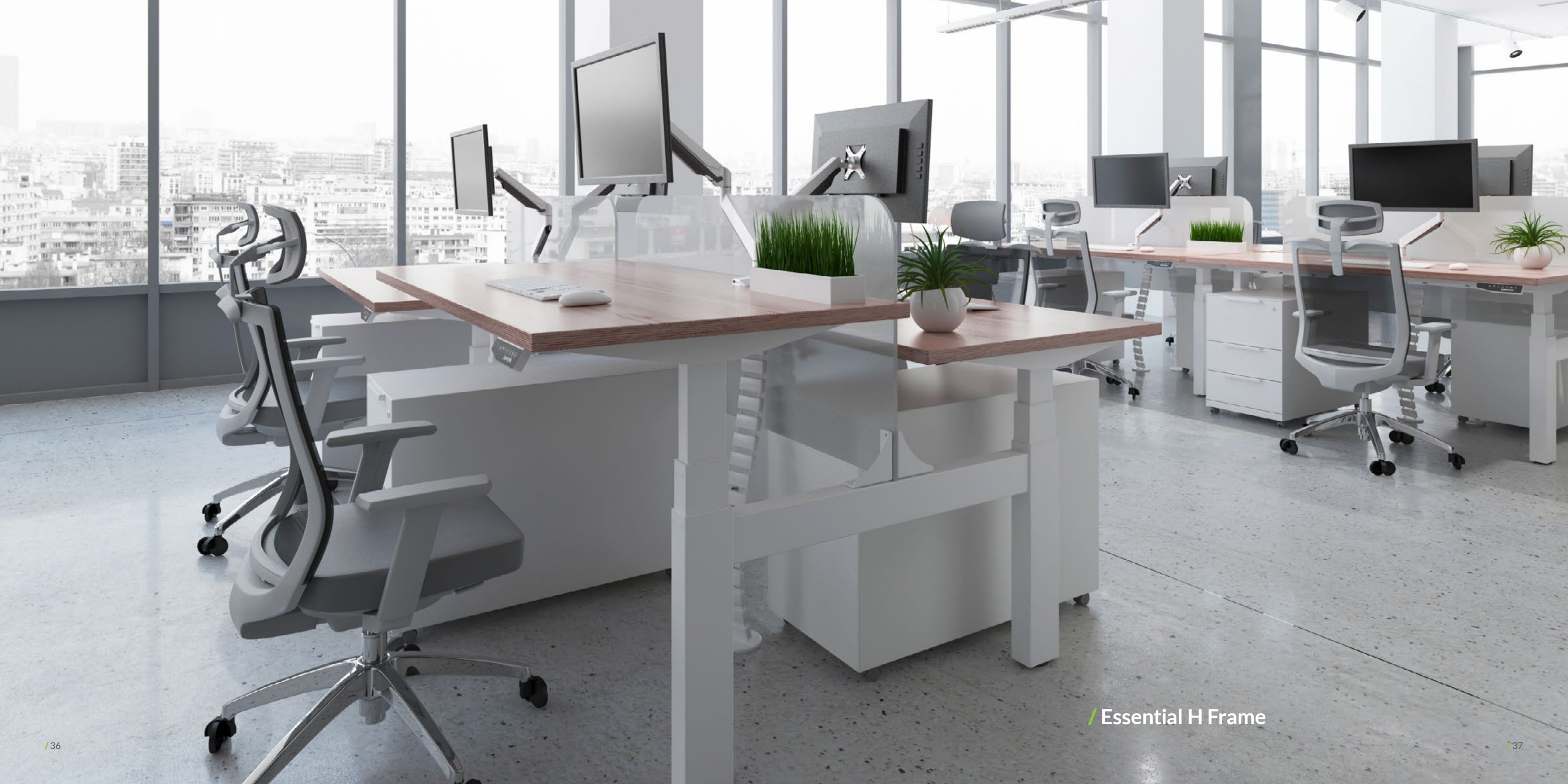
/ Essential H Frame