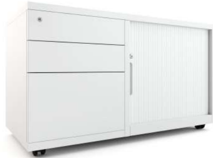
White Mobile Caddy