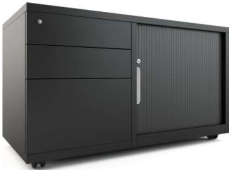
Black Mobile Caddy