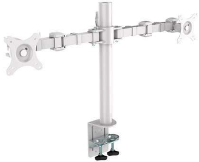
SS Double Monitor Arm