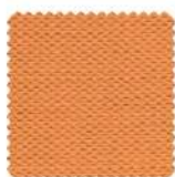
Paw Paw 139